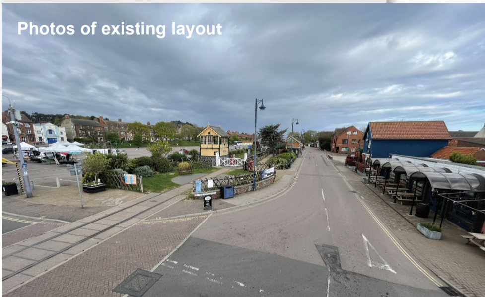
Photos of existing layout