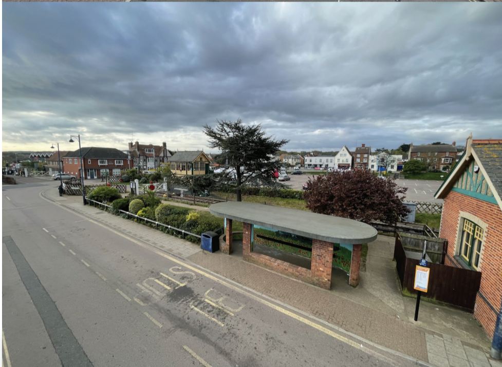
Images of proposed new layout